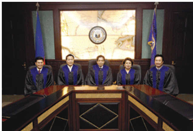
THIRD DIVISION OF THE PANGANIBAN COURT. Justice Leonardo A. Quisumbing (seated, center), the Division chairperson; with Justices Dante O. Tinga, Antonio T. Carpio, Conchita Carpio Morales, and Presbitero J. Velasco Jr.