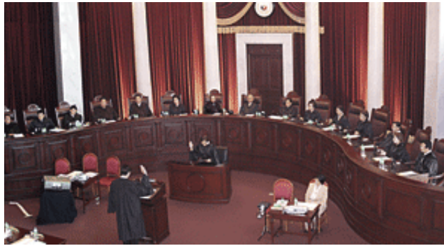
THE PANGANIBAN COURT IN SESSION. Chief Justice Artemio V. Panganiban (center); with (l-r) Justices Cancio C. Garcia, Dante O. Tinga, Romeo J. Callejo Sr., Renato C. Corona, Antonio T. Carpio, Consuelo Ynares Santiago, Reynato S. Puno, Leonardo A. Quisumbing, Angelina Sandoval-Gutierrez, Ma. Alicia Austria-Martinez, Conchita Carpio Morales, Adolfo S. Azcuna, Minita V. Chico-Nazario, and Presbitero J. Velasco Jr.

the entire Court, behind closed doors, all by themselves - with no clerks, no secretaries, no assistants, no guards, absolutely no one else around -- deliberates on and decides en banc case.