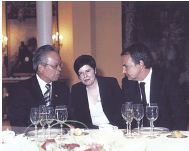
STATE DINNER. The photo shows Chief Justice Panganiban with His Excellency, Jose Luis Rodriguez Zapatero, President of Spain, during a state dinner hosted by the latter on June 29, 2006, at the Moncloa Palace in Madrid. Seated between them is a Spanish-English interpreter. The following day, Chief Justice Panganiban signed a Judicial Cooperation Agreement with Spanish Chief Justice Francisco Jose Hernando Santiago.