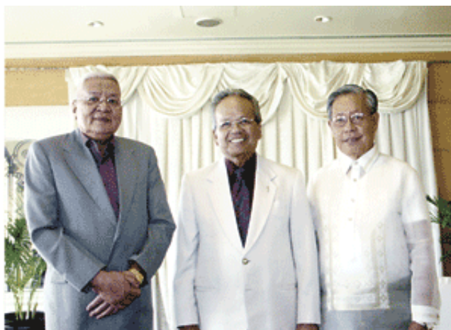
WITH RETIRED JUSTICES. Between former Chief Justices Andres R. Narvasa (left) and Hilario G. Davide Jr. (right) stands Chief Justice Panganiban, who hosted a luncheon in honor of retired Supreme Court justices on June 8, 2006, at the Diamond Hotel in Manila.