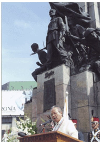
INDEPENDENCE DAY. Chief Justice Panganiban delivers his address as guest speaker during the