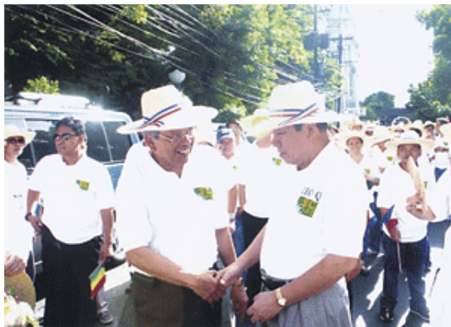
SC ANNIVERSARY. Chief Justice Artemio V. Panganiban greets Justice Leonardo A. Quisumbing during the “Employees Grand Parade” marking the 105 th Anniversary of the Supreme Court (SC) on June 11, 2006. The parade was followed by a Mass and a cultural program for Supreme Court employees.