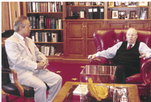
U.S. SUPREME COURT VISIT. Chief Justice Panganiban takes time out to visit his friend, U.S. Supreme Court Justice Anthony Kennedy, in Washington, DC, during a Knowledge-Sharing/Lecture Circuit, which also covered New York City, Madrid, Paris, and London from May 10 to 28, 2006.