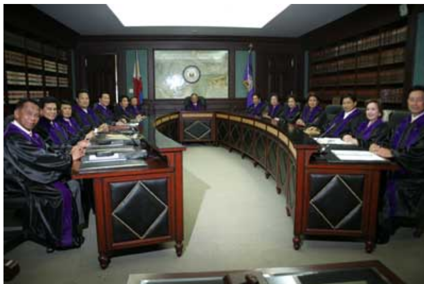
THE PANGANIBAN COURT IN CONFERENCE. Aside from the Session Hall, the En Banc Conference Room is perhaps the most sacred spot in the Supreme Court building. It is where the members of