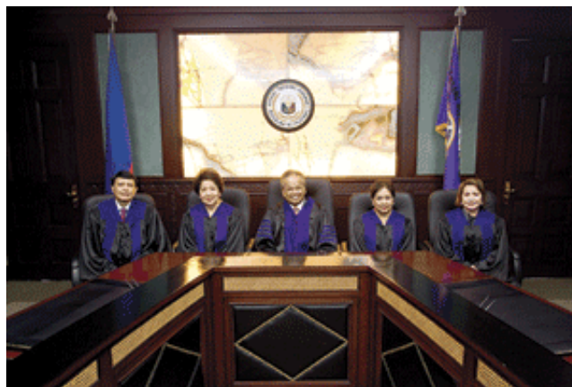
FIRST DIVISION OF THE PANGANIBAN COURT. Chief Justice Artemio V. Panganiban (seated, center), the Division chairperson; with (l-r) Justices Romeo J. Callejo Sr., Consuelo Ynares-Santiago, Ma. Alicia Austria-Martinez, and Minita V. Chico-Nazario.